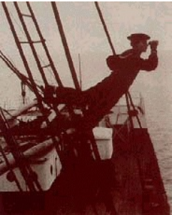
Buster Keaton looking expectantly "The Navigator" 1924

Imminent - An adjective from the Latin word imminens from imminere = to hang or project over. Literally, imminent means hanging or projecting over. Impending.